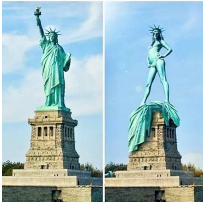
climate change hits New York

That's why I don't dust. It could be someone I know.